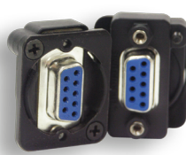
EHHD9FFB (black)* EHHD9FF (nickel)*