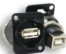
EHUSBABB (black) EHUSBAB (nickel)