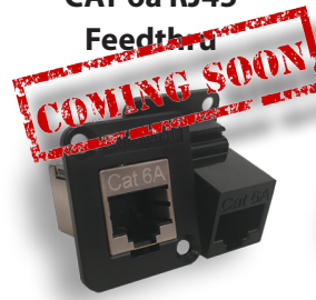
EHRJ45P6AS (shielded) EHRJ45P6A (unshielded)