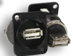
EHUSBAAB (black) EHUSBAA (nickel)