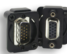
EHHD15MFB (black)* EHHD15MF (nickel)*