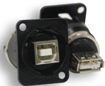
EHUSBBAB (black) EHUSBBA (nickel)