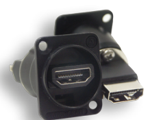
EHHDMI2B (black) EHHDMI2 (nickel)

*replace M or F in part number for male or female contacts, respectively. All combinations available.