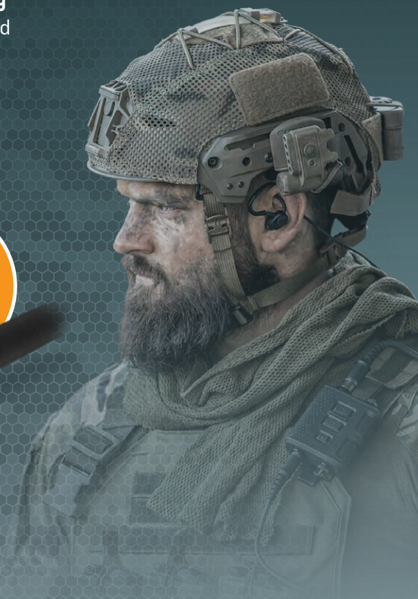
ODU AMC ® High-Density SCREW-LOCK