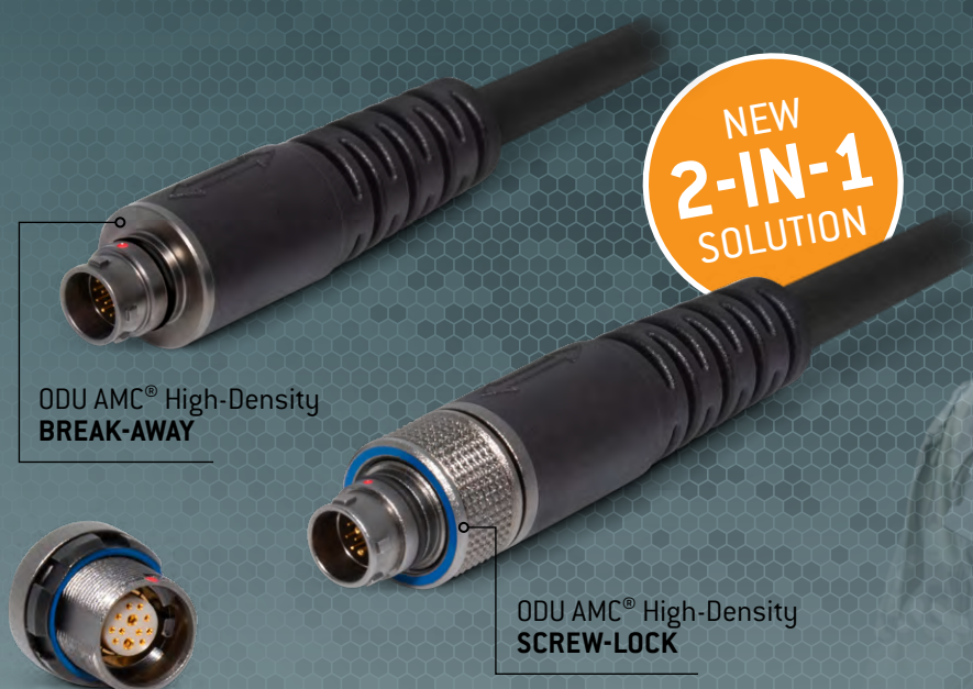
ODU AMC ® High-Density BREAK-AWAY

The new flexible 2-in-1 solution, of the ODU AMC ® High-Density series offers on the one hand the possibility of fast locking and unlocking of the connection and on the other hand additional protection through screw locking in case of high resistance to vibration whenever this is necessary.