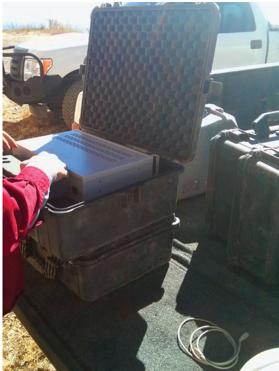
A VNA is transported to the maintenance site

Wireless infrastructure is often remotely located and difficult to access—or may be completely inaccessible—due to adverse weather conditions. It is critical to perform regular maintenance like visual inspection and RF testing of exterior cabling and antennas, and testing and adjustment of radios and combining networks. Maintenance is performed on two types of links: the RF radio networks and the microwave links that provide backhaul.