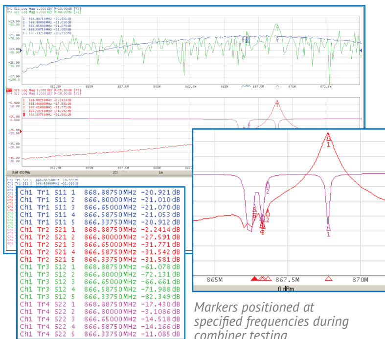
Markers positioned at specified frequencies during combiner testing

reflected back into the radio—should be below some threshold maximum to ensure a good match from the radio output to the combiner. A pass/fail value for return loss might be -18 dB RL, with values of -21 dB or even -22 dB being quite attainable. Similarly, S_{22} return loss is compared against some threshold at the nominal operating frequency of each transmitter, perhaps with a -15 dB goal. Because the markers have been pre-positioned at the frequencies of interest, the return loss values can be readily determined from the marker table, as shown at left.